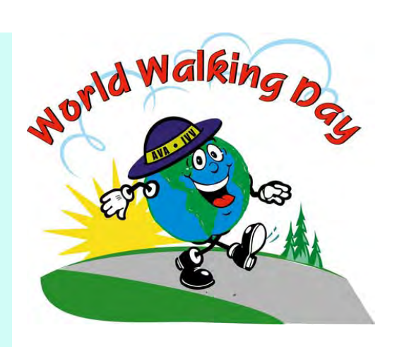
Click on image to view website.

Let me know how many copies of the certificate that you would like- at least a week before you need them.