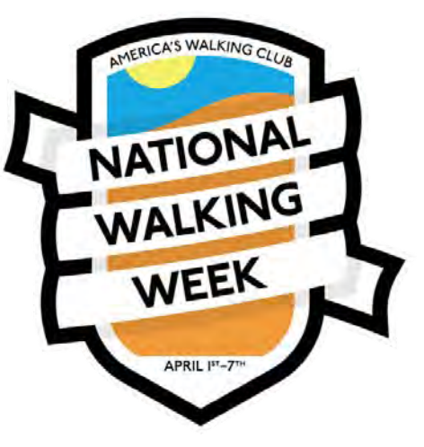
Click images to go to fill out form.

This year is the fifth year of our National Walking Week campaign. Last year we had 38 participating Clubs and 75 events in 19 states. If your Club would like to participate this year and would like us to promote your event on social media and the AVA website, please click the link under the logo and fill out the form by March 31st. To help promote your events you can also download our pre-made event certificates, logo, flyers, and social media banners by clicking here. Don't forget to send out a local press release for your event and ask local officials to issue a Proclamation in support of National Walk Week. You can find templates of these forms on the AVA home page. For more information on National Walking Week go to ava.org.