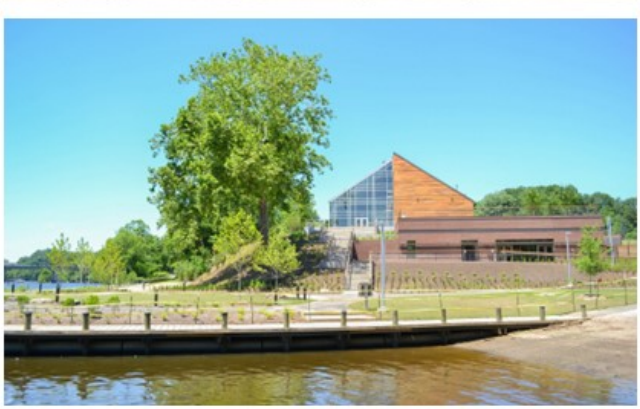
Love sculpture at Workhouse Arts Center, Memorial and Brickmakers Café at Occoquan Park

Celebrate spring by joining NVV's 40<sup>th</sup> Anniversary traditional volksmarch, our club's monthly Wednesday Walk, pre-meeting evening stroll, new seasonal or any of the terrific year-rounds.