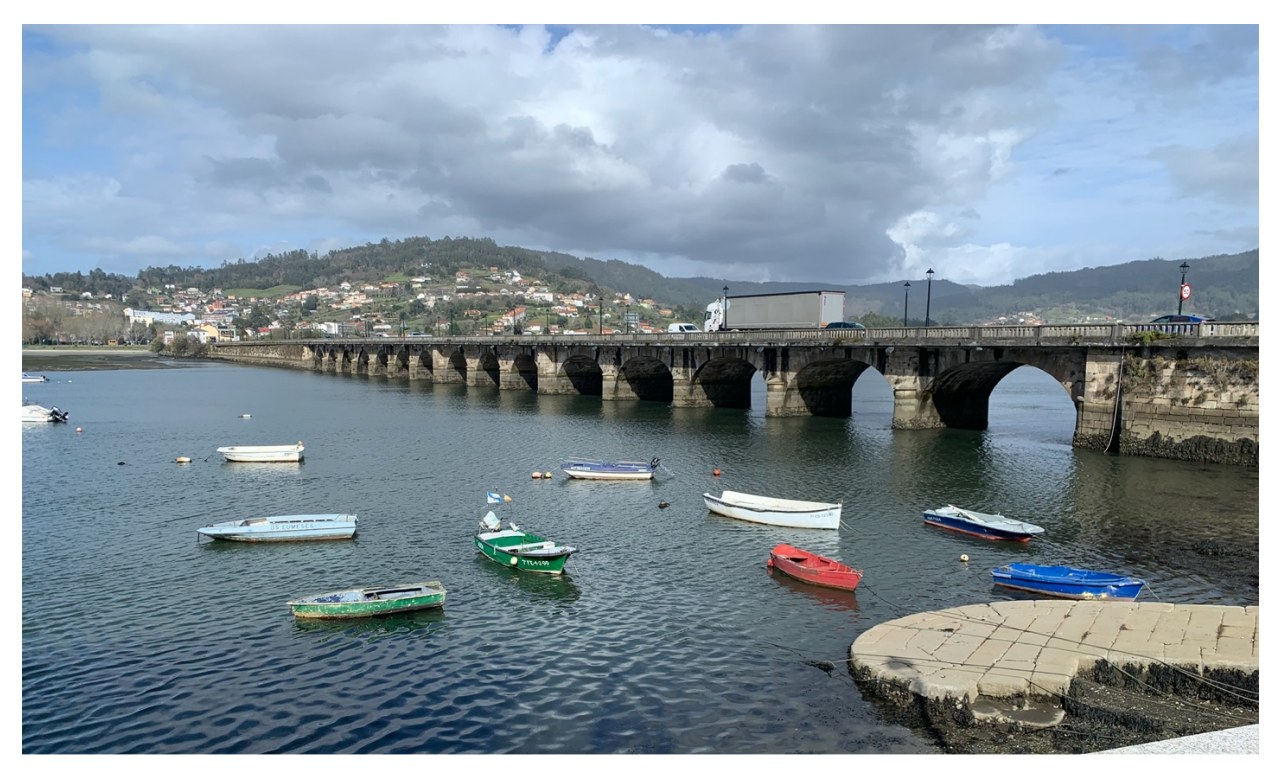
A medieval bridge on the Camino in Spain.