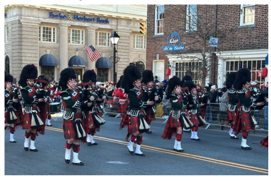
Here is a band from York, Pa.

Scottish pipe bands from around the region converged for the Scottish Walk. This group was from Washington.